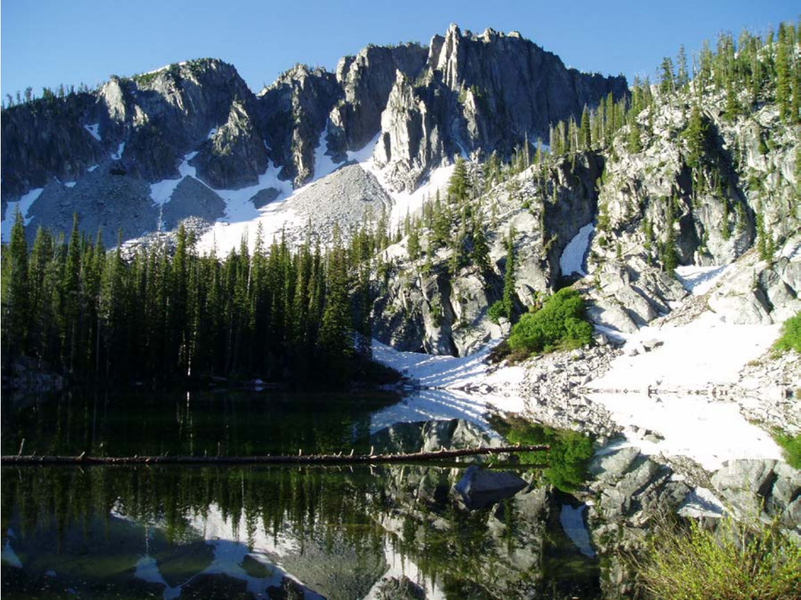
Middle Rainbow Lake

I only saw a handful of people on the hike so I felt solitude on the trip. That will not be the case a few weeks from now when everyone knows the roads are open. The flowers were blooming and butterflies were everywhere. It was a very inspiring place.