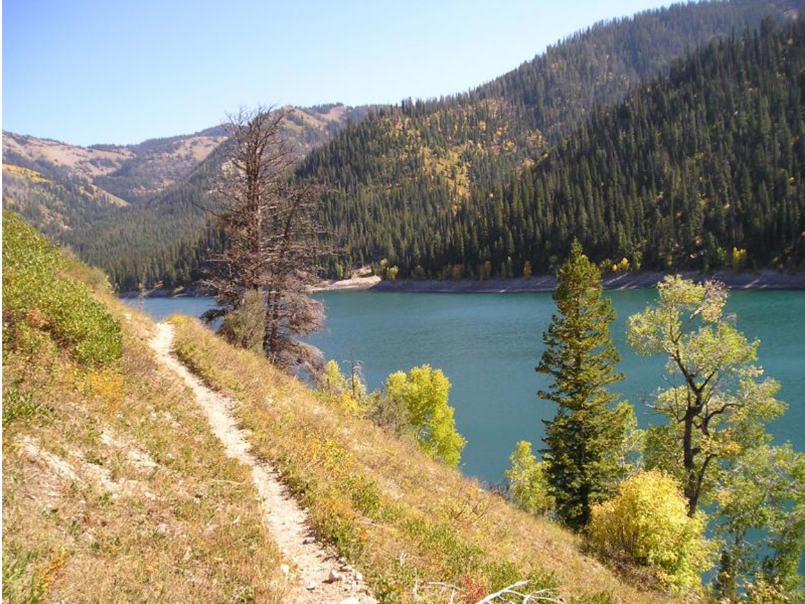
Hiking along Upper Palisades Lake

I continued targeting fish along the bank and there were plenty of them and all were easily enticed to sip my fly. Excellent fishing! I caught fish consistently for the next hour before I decided to hike up to the inlet and fish some of the coves. By the time I reached the inlet it was just over a 15 mile round-trip hike.