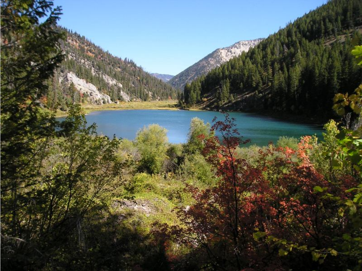
Lower Palisades Lake

It took me about 1:15 to reach the 6131' lower lake at 4 miles which is just over a 500' elevation gain from the trailhead. I walked across the bridge at the outlet and walked up the west side of the lake. The lake was shallow on the west side and I didn't see any fish. I decided to continue up the trail rather than walk to the other side of the lake where it was deeper.