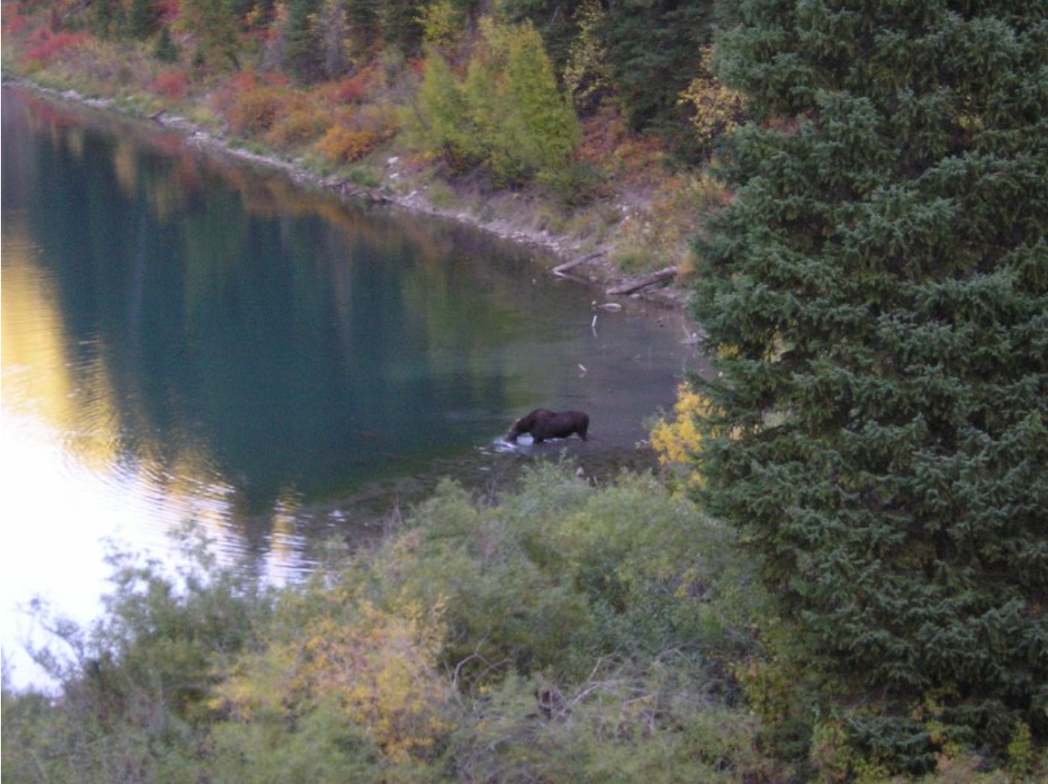
Moose at lower Palisades Lake