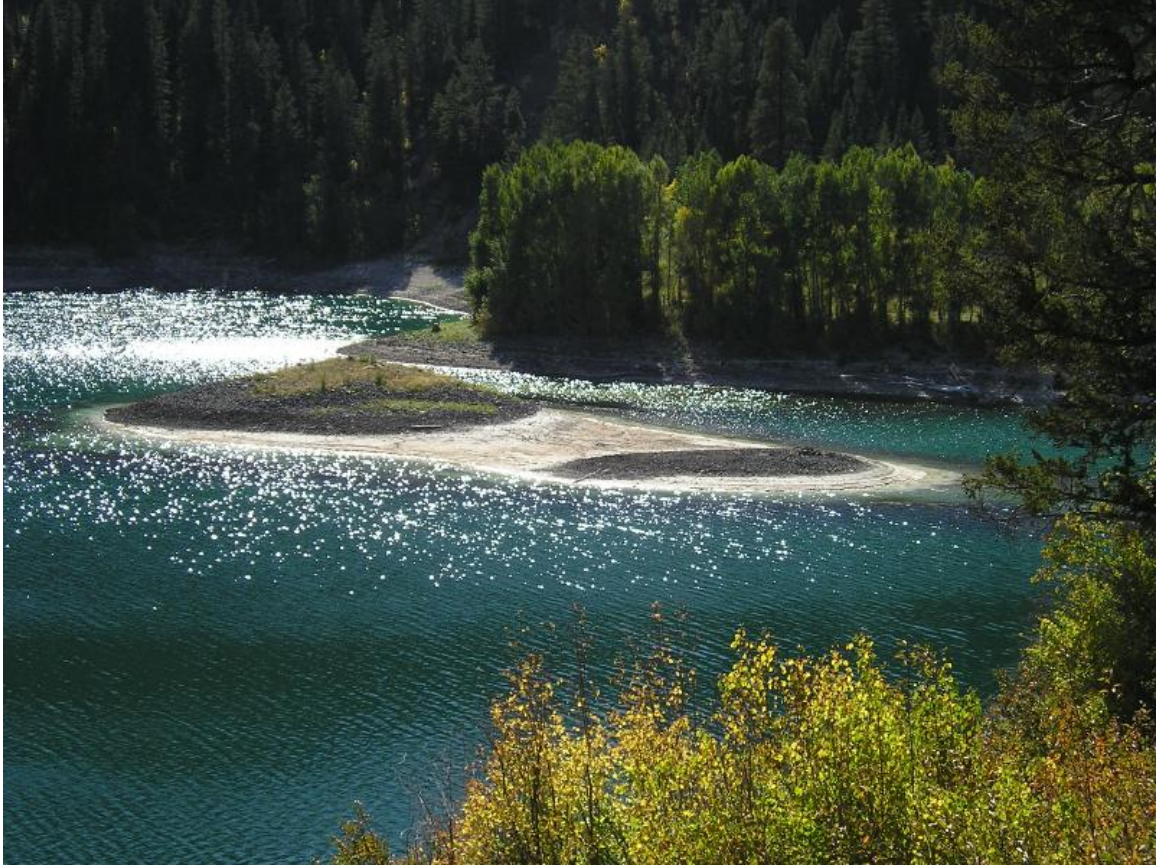
Near the outlet of Upper Palisades Lake

After eating lunch near the cabin I continued up the well signed trail to the upper lake at 6633'. The last section of the trail climbs 400' in a little less than a mile and just over 1000' from the trailhead but it wasn't too bad with the switchbacks. I reached the lake and it was beautiful and much larger than I anticipated at 16,000 Acres and about a mile long. I started by fishing the outlet.