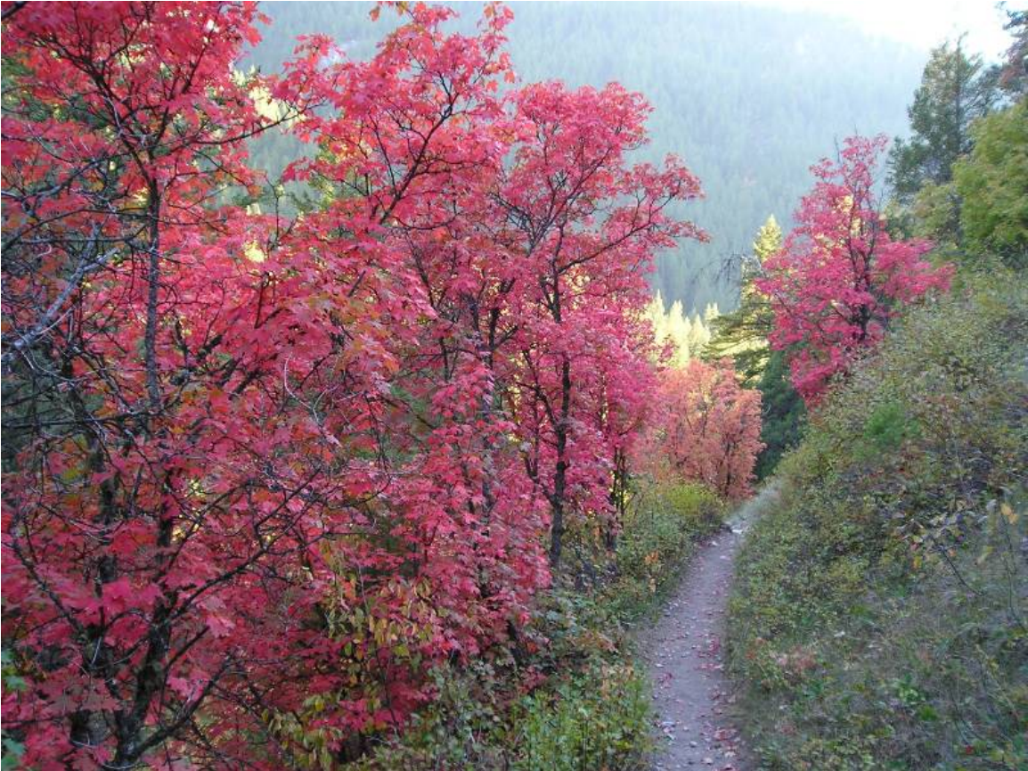
Fall colors along the trail