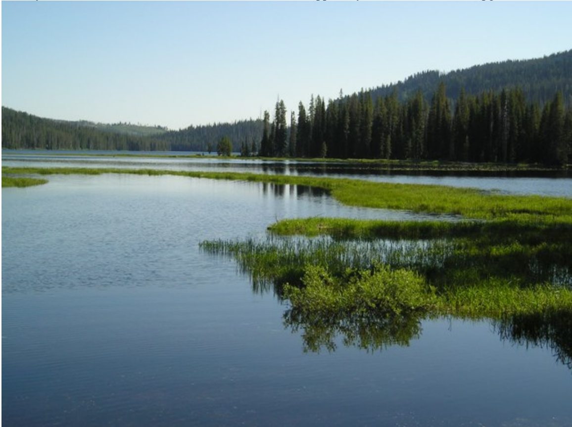
Upper Payette Lake near the campground (below)