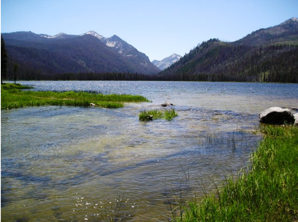
Loon Lake from the outlet