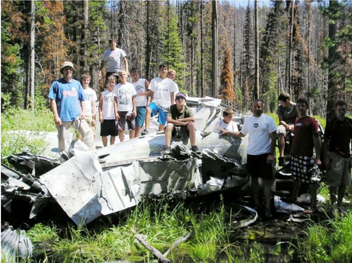
World War II Bomber crash site