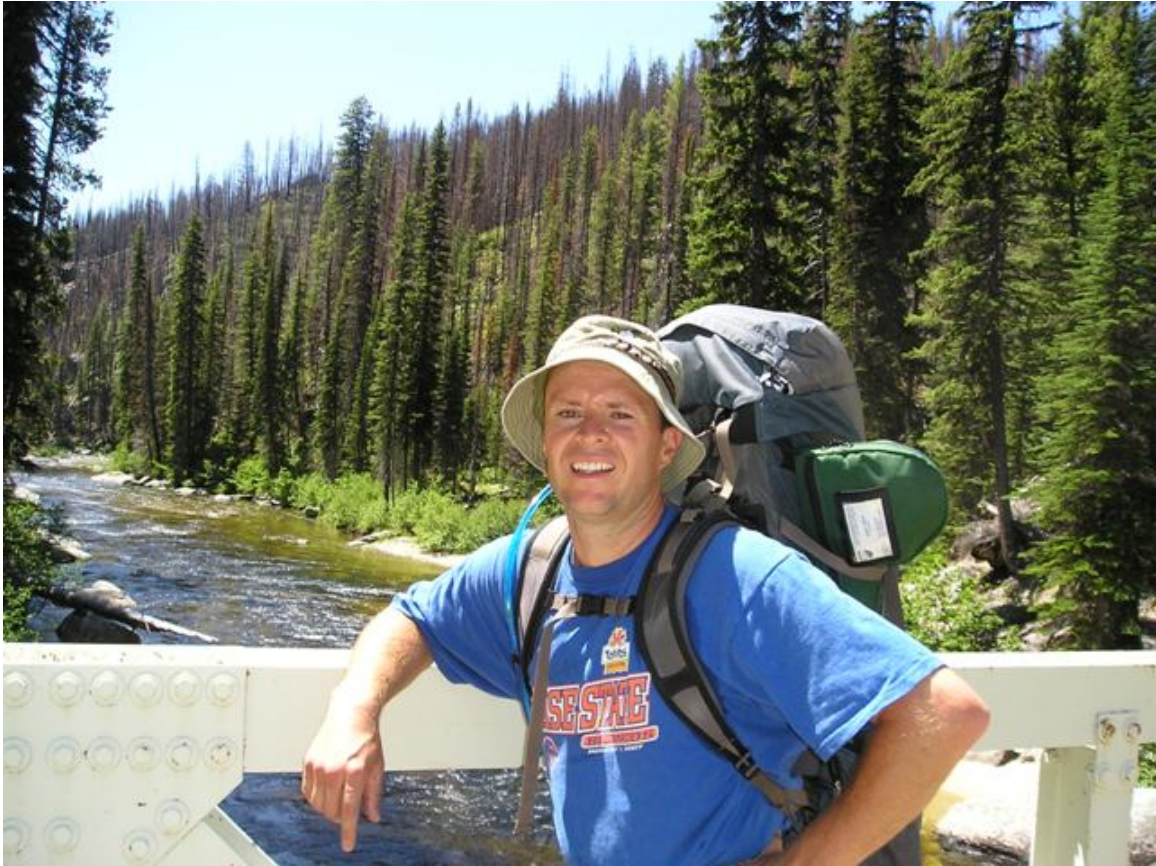
Crossing the bridge over the Secesh River