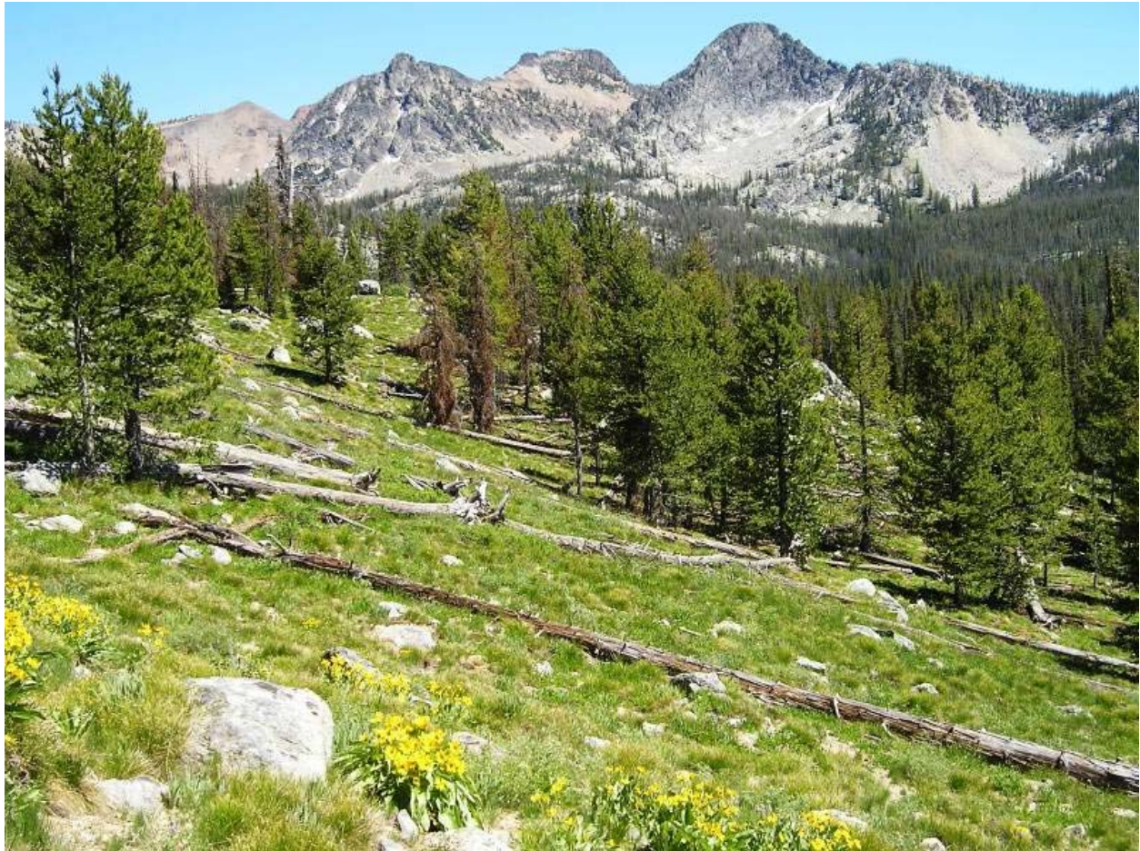
The view of the peaks from the cutoff trail