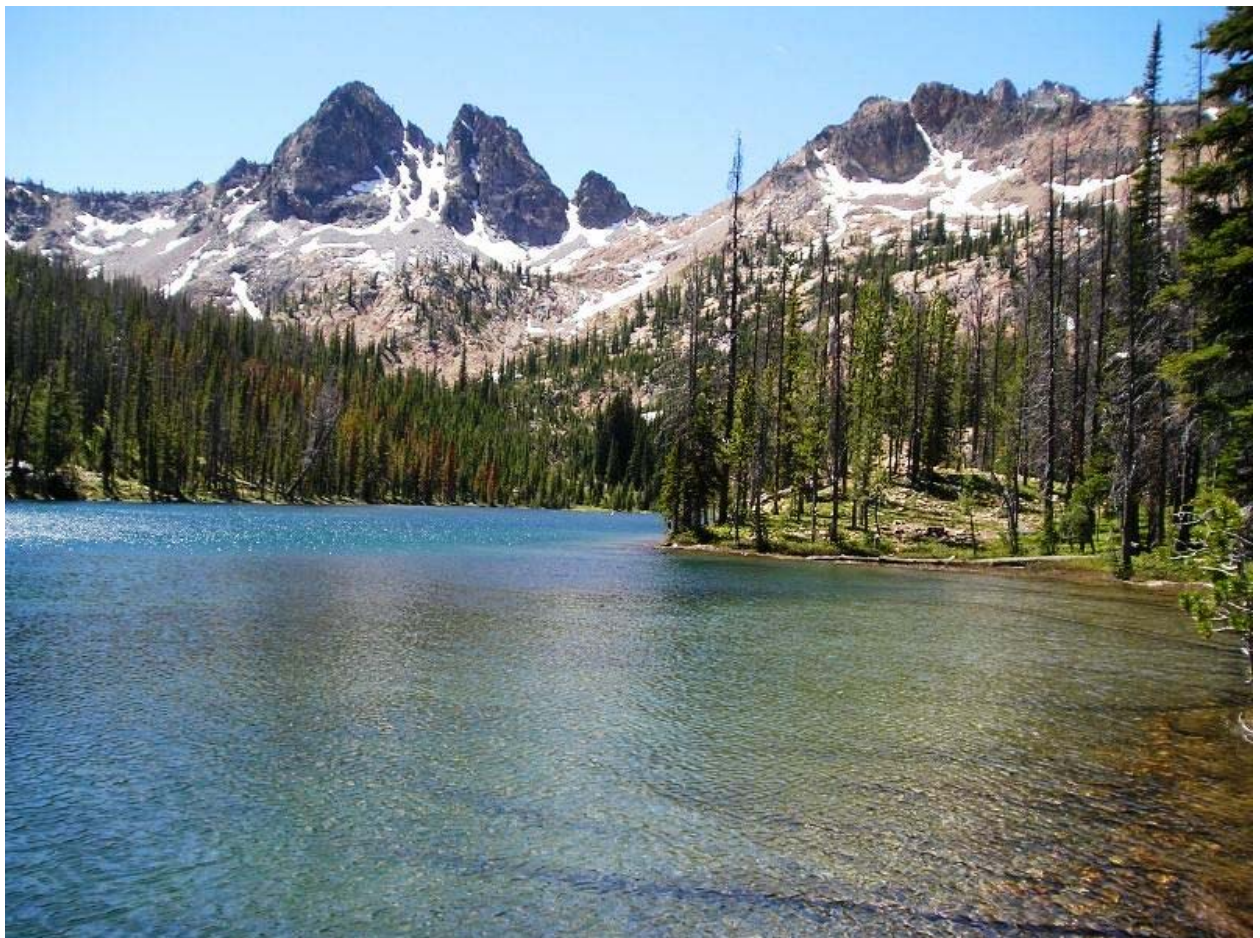
Beautiful Crimson Lake