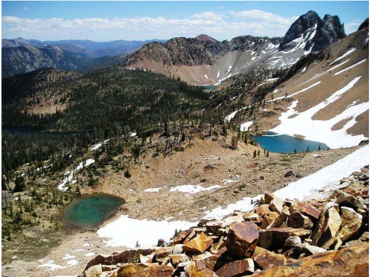
The view from the ridge looking down at Crimson Lake