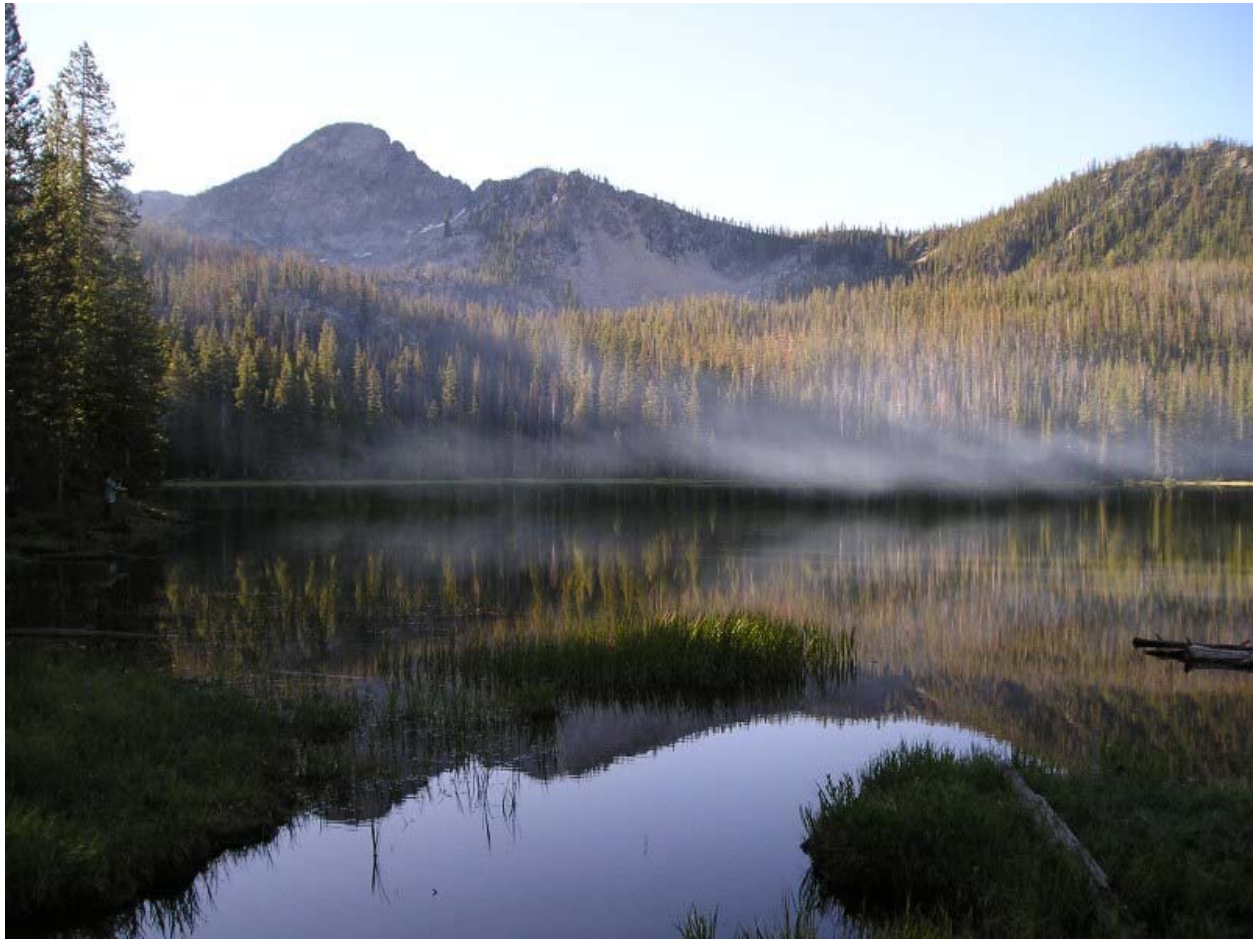
The view from camp at sunrise