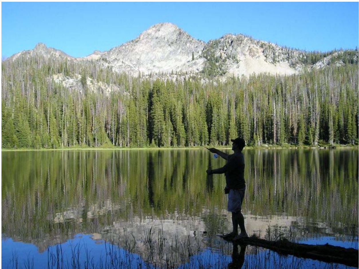
Fishing near our campsite